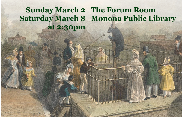
Zoological Gardens, Regent's Park, by George Johann Scharf 1835

Sunday March 2 The Forum Room Saturday March 8 Monona Public Library at 2:30pm