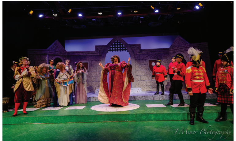
Clockwise from top left: (1) July 20, Patience Concert at Capitol Lakes, (2) August 4, Free Children's Patience Pre-show, (3) August 2-11, 2024 Madison Savoyards presented Patience at the Bartell Theatre, and (4) December 6, caroling on Monroe Street