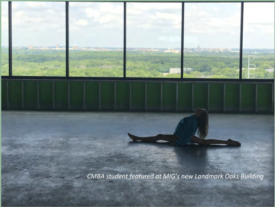
CMBA student featured at MIG's new Landmark Oaks Building