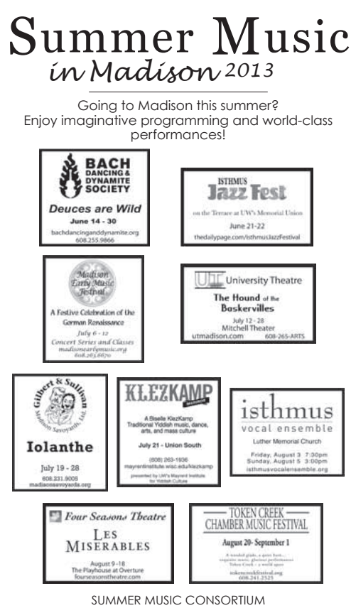
SUMMER MUSIC CONSORTIUM is a collective of nine exciting groups on the Madison summer arts scene.

This production of Iolanthe is being recorded, for release in early 2014.