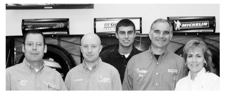
Monday - Friday 7 AM - 8 PM; Saturday 7 AM - 5:00 PM; Sunday 9 AM - 5 PM Tires, Repair & Service - Domestic & Foreign

453 S. Gammon Road, Madison, WI 53719 (608) 833-1735