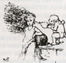
[Courtied by a fickle breeze]